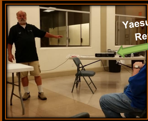
Yaesu Fusion Repeater