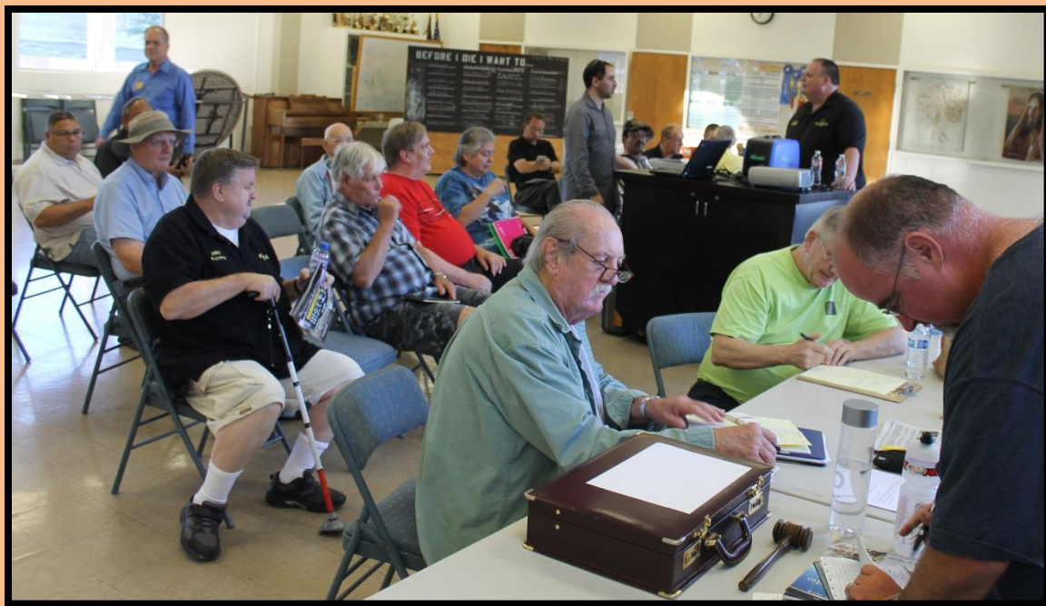
Waiting for presentation to begin & taking care of business