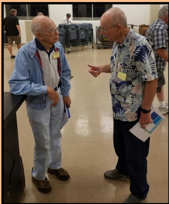
Sharing info and socializing